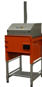
The single-chamber unit with swing door