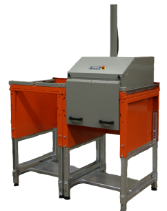
The multiple-chamber unit equipped with an apron with two handles