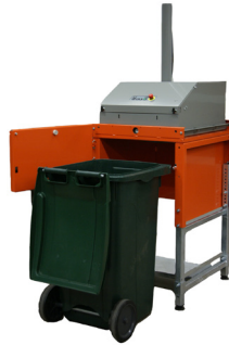
Designed to fit the standard 240 Liter bins in the market.

Model 4240 is user-friendly! The multi-chamber version is a convenient top-loading installation, while the single-chamber version has an easy wheel-in, wheel-out operation. Safety and quality are our hallmarks and the compactor provides maximum personal safety both for the operator and those in the immediate vicinity. A bin indicator assures that the machine can only start, when the bin is in the right position.